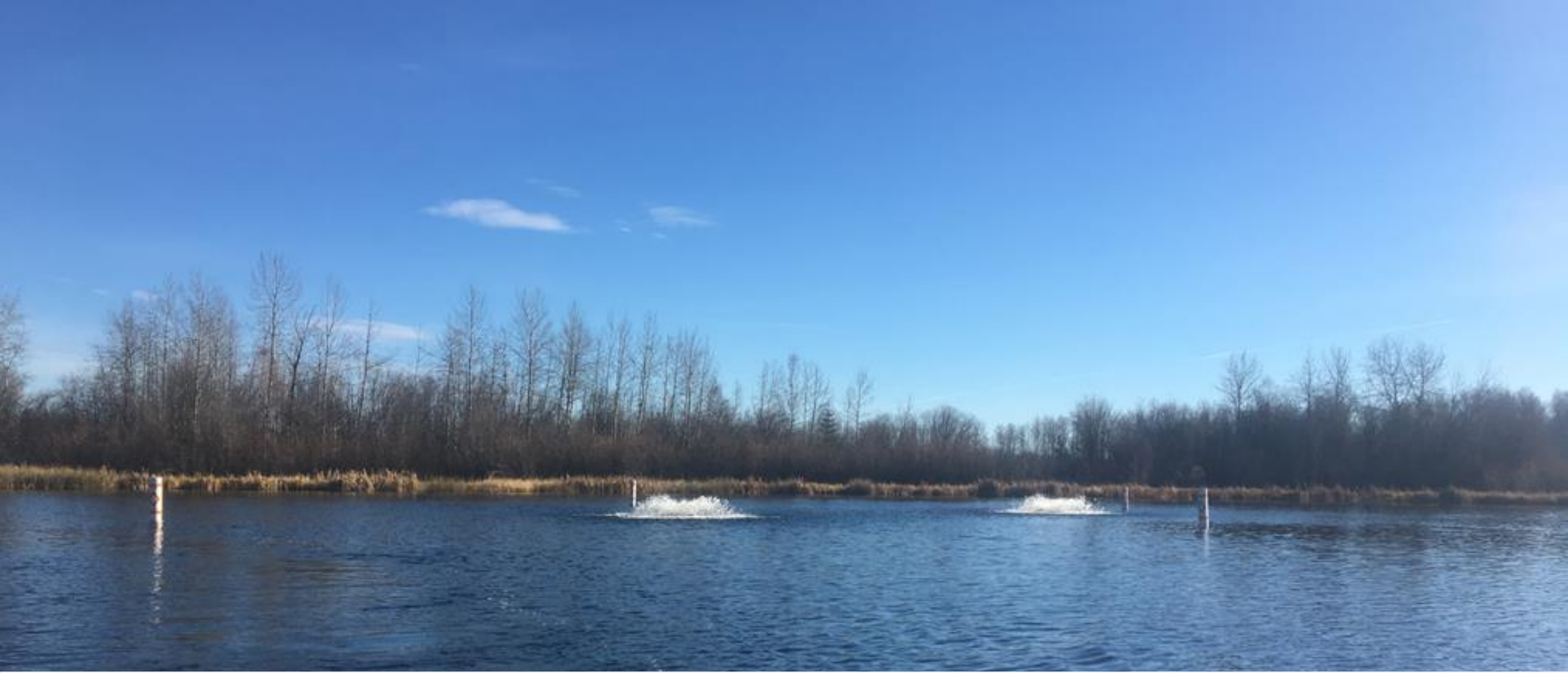
West Dollar Lake Aeration - October