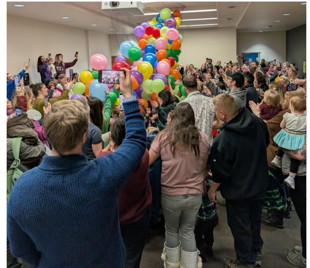
GPPL's Noon Year's Eve Party