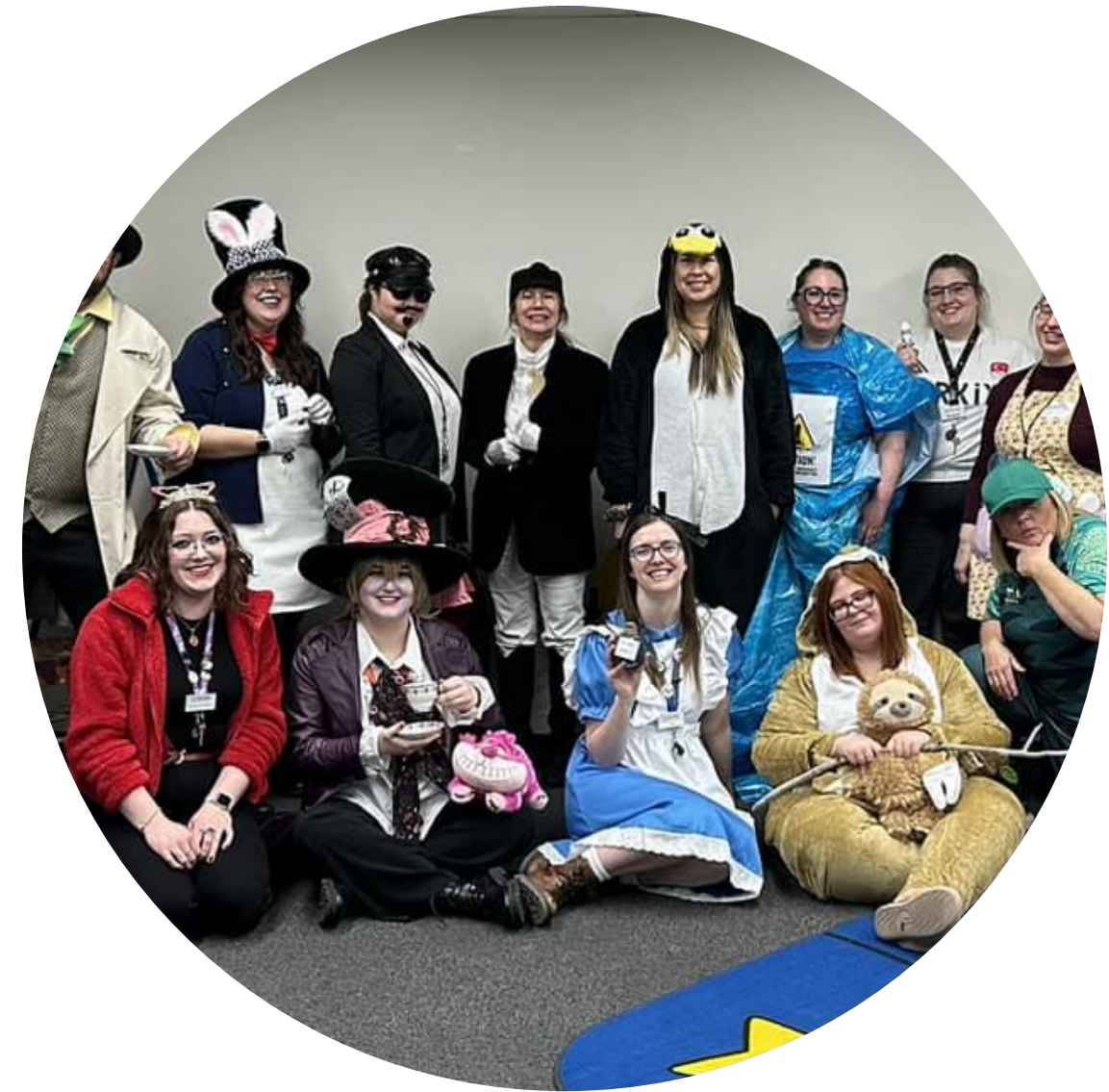
GPPL Staff on Halloween 2024